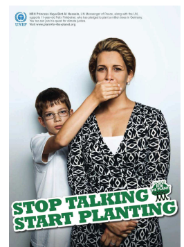
Her Royal Highness Princess Haya bint Al Hussein