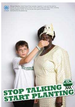
Wangari Maathai 2004 Nobel Peace Prize

For its fourth Earth Guest day, which is also Earth Day's 40th anniversary, Accor is supporting Stop Talking, Start Planting , another initiative that partners UNEP's "Plant for the Planet: Billion Tree Campaign". Involving 132 children from 45 countries, the campaign is intended to raise awareness among the general public and political leaders of their responsibility to future generations. Accor hotels in a number of large cities provide these young ambassadors with free access to their conference facilities so that they can more effectively transmit their message to schoolchildren, customers, employees, and important local figures.