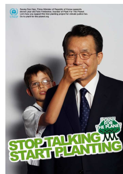
Seung Soo Han Former Prime Minister of South Korea